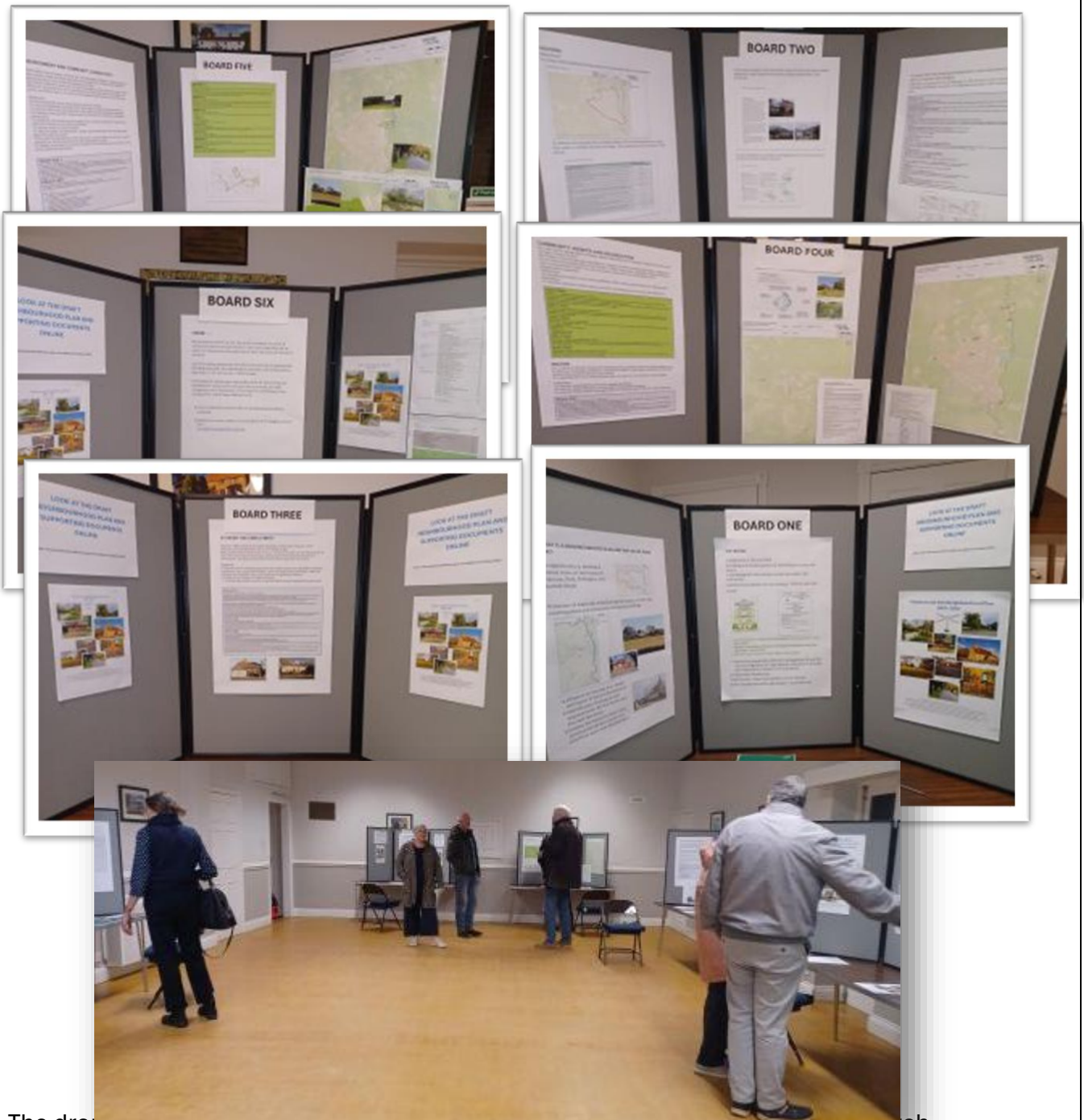
The drop in events were advertised via the website, Parish Council E-News, Church Newsletter, Facebook, notice boards and six banners put up around the Parish.